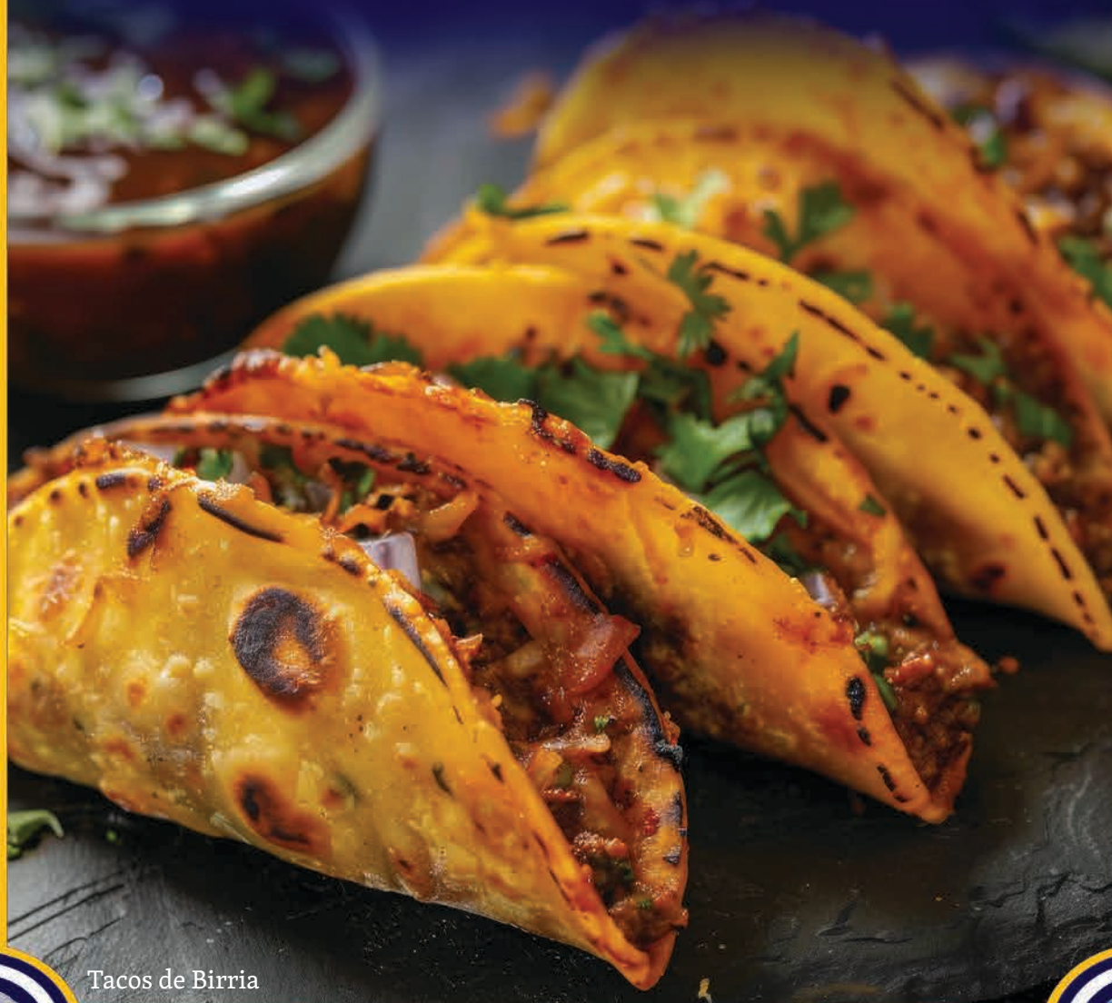
Tacos de Birria